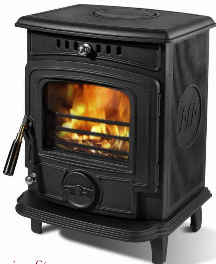
Baby Gabriel® Wood Burning Stove